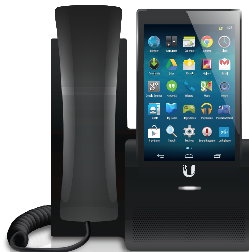
Multi-Touch Color Display

5" or 7" High-Definition, Multi-Touch Color Display Navigate the UniFi VoIP Phone using the touchscreen display.