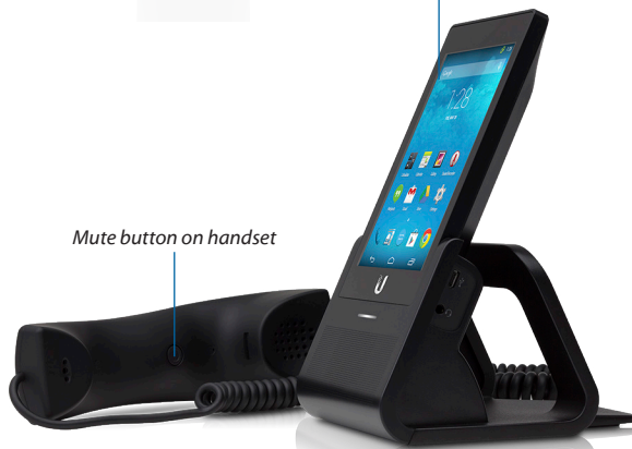
Mute button on handset