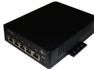
TP-SW5G-D (802.3af/at) TP-SW5G-NC TP-SW5G-MULTI TP-SW5G-24 (802.3af/at)