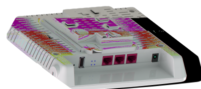
I/O Region (all models)