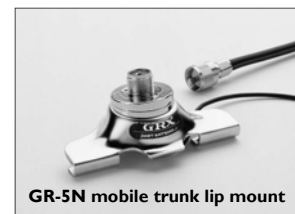
GR-5N mobile trunk lip mount