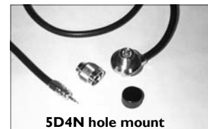
5D4N hole mount