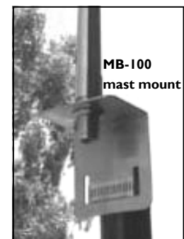
MB-100 mast mount