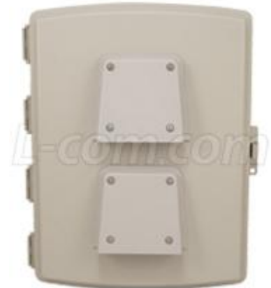
Vented Lid with Rain Shields in place