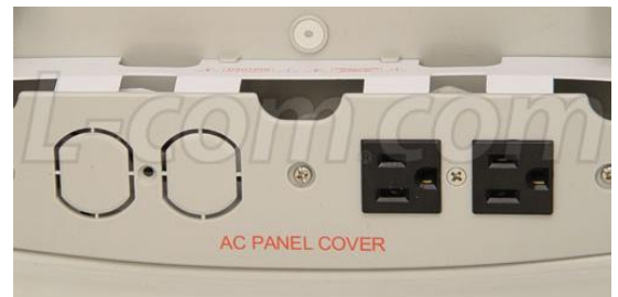
120 VAC Power Panel