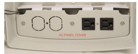
120 VAC Power Panel