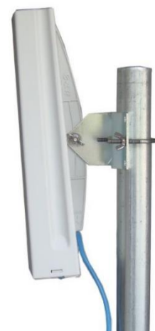
EZ-Bridge®-LT tool-less installation