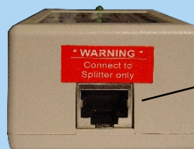
Power Supply Inserter Data IN