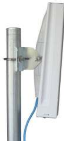
Simple & Functional Design