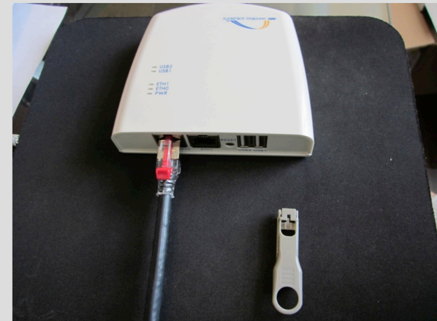
3. Lock inserted to secure connector to device.