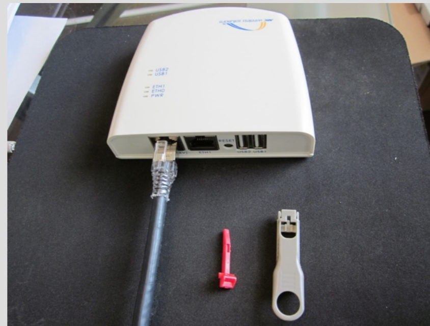
2. Connector inserted into the device.