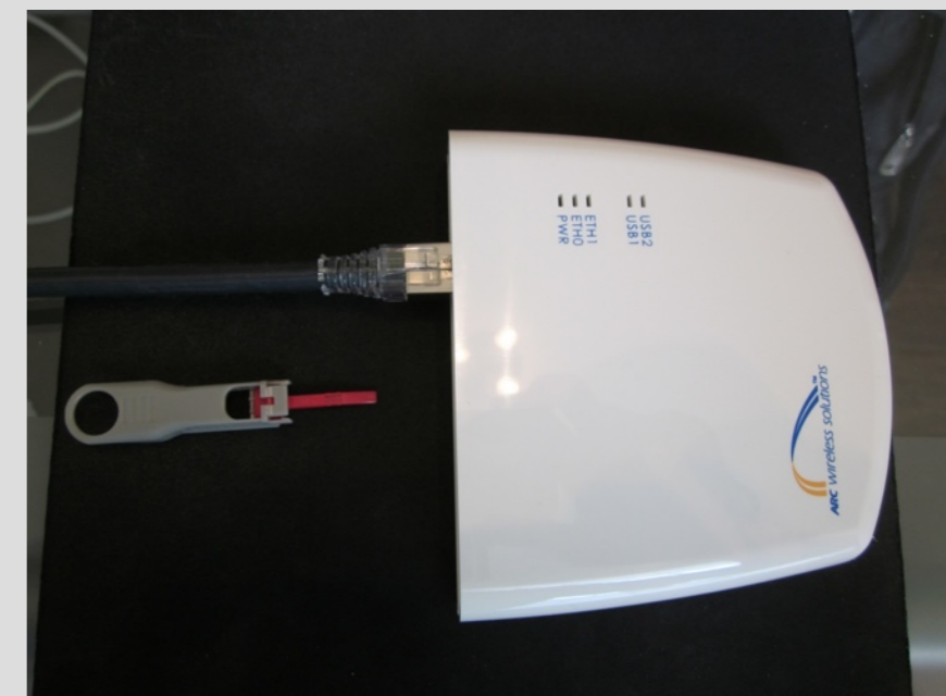
6. Lock removed from connector. The cable can now be removed from the device.